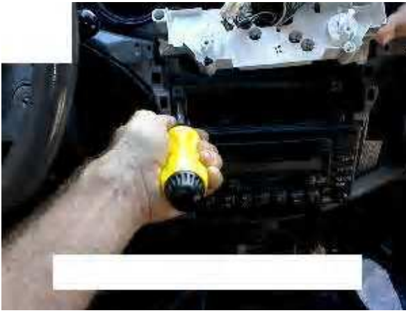
15.1) Remove one exposed screw above left of car stereo.