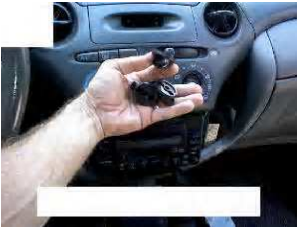
5.1) Remove remaining two knobs from AC control.