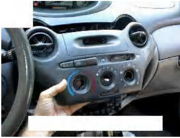
9.1) Pull panel from dash releasing clips.