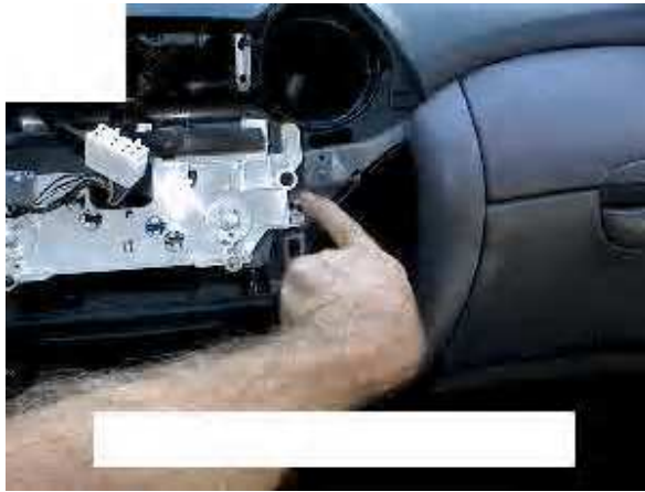
13.1) Locate lock on right side of AC panel.