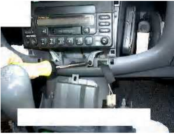
3.1) Remove one exposed screw below on right of car stereo.