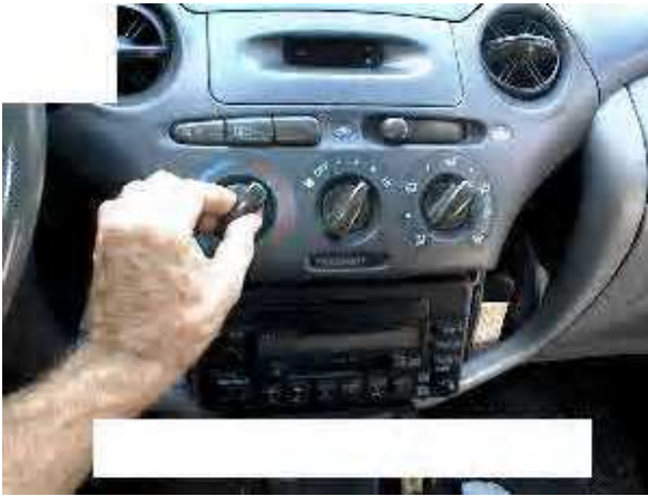
4.1) Remove AC control knob.