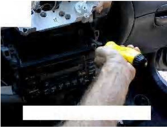
16.1) Remove one exposed screw above right of car stereo.