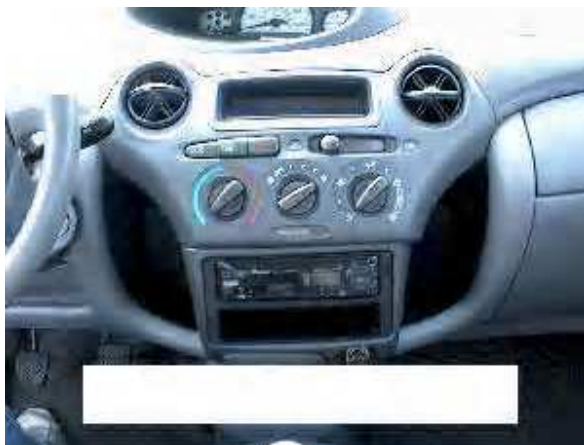
6.1) Completed installation