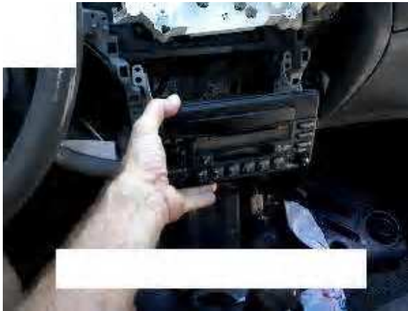
17.1) Pull car stereo from dash.