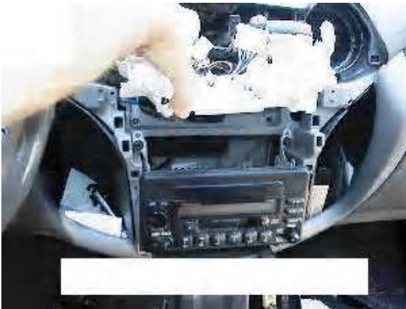
14.1) Pull AC control panel from dash, you may need help holding this panel up.