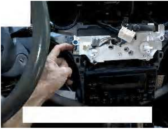
12.1) At remaining AC control panel, locate lock on left side.