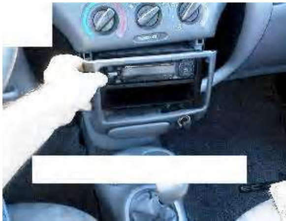
5.1) Assemble dash.