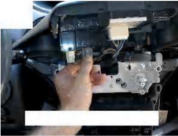
10.1) Tilt bottom of panel up for access, release triggers on connectors to disconnect.