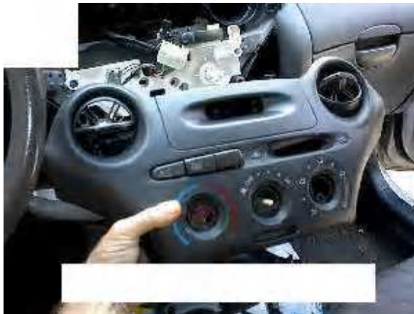
11.1) Remove panel and set to side.